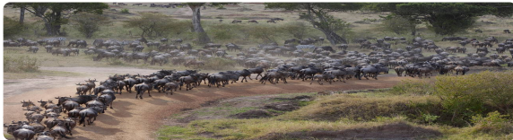
Serengeti National Park