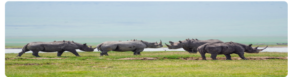
Ngorongoro Conservation Area