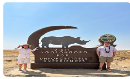
Ngorongoro Conservation Area