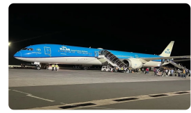
Kilimanjaro International Airport JRO