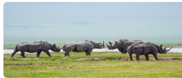
Ngorongoro Conservation Area