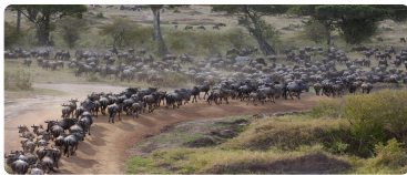
Serengeti National Park