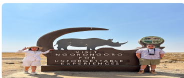
Ngorongoro Conservation Area