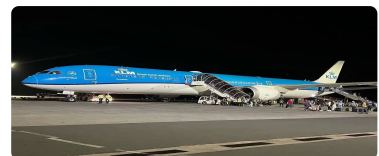
Kilimanjaro International Airport JRO