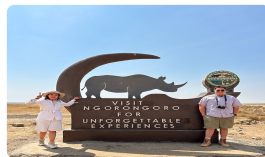
Ngorongoro Conservation Area