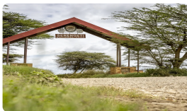
Serengeti National Park