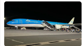
Kilimanjaro International Airport JRO