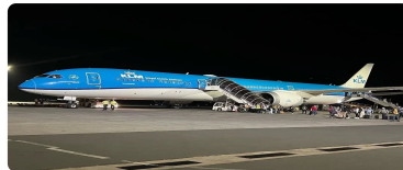
Kilimanjaro International Airport JRO