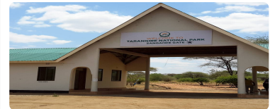
Tarangire National Park