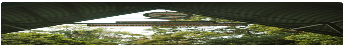
Kilimanjaro National Park