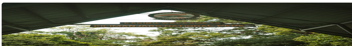
Kilimanjaro National Park