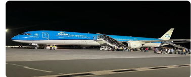
Kilimanjaro International Airport JRO