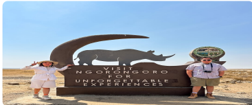
Ngorongoro Conservation Area