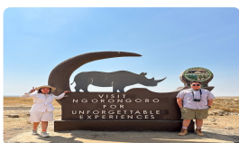
Ngorongoro Conservation Area