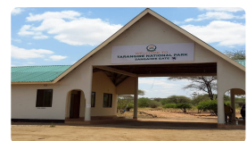
Tarangire National Park