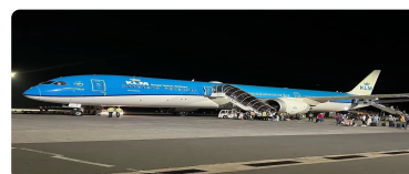
Kilimanjaro International Airport JRO