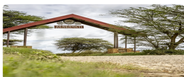
Serengeti National Park