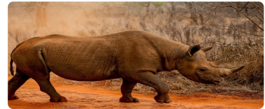
Mkomazi National Park