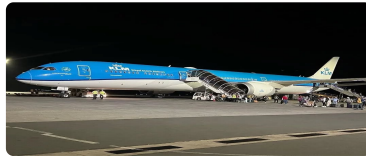
Kilimanjaro International Airport JRO