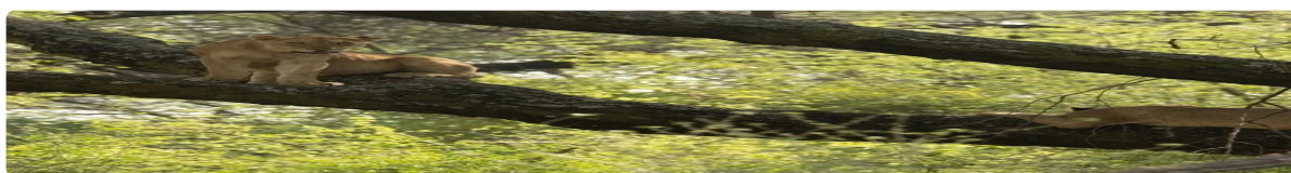
Lake Manyara National Park