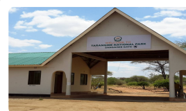
Tarangire National Park