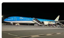
Kilimanjaro International Airport JRO