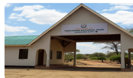
Tarangire National Park