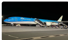
Kilimanjaro International Airport JRO