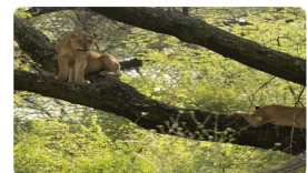
Lake Manyara National Park