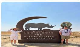
Ngorongoro Conservation Area