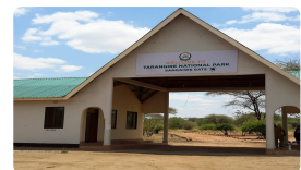
Tarangire National Park