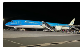
Kilimanjaro International Airport JRO