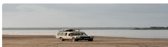
Ndotu & Southern Serengeti