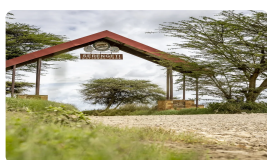
Serengeti National Park