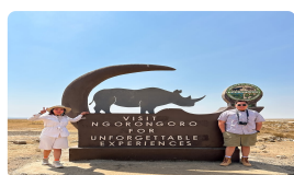
Ngorongoro Conservation Area