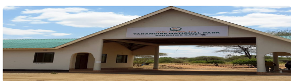
Tarangire National Park