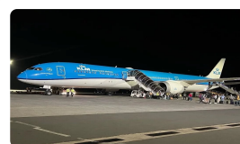
Kilimanjaro International Airport JRO