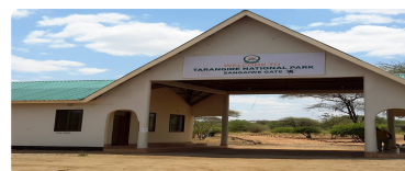
Tarangire National Park