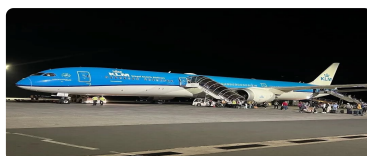
Kilimanjaro International Airport JRO